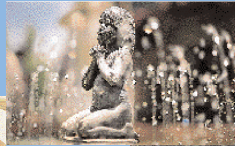
The J. C. Nichols Memorial Fountain (far left) at the Country Club Plaza. On this page, clockwise from the top are: the Little Mermaid Fountain, the Meyer Circle Sea Horse Fountain and the Seville Fountain.