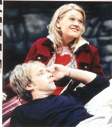
The Almaden Street Tower (far left) is an architectural dream. Mix Vigorously and Ingest by Lari Pittman (above) is at the San Jose Museum of Art (Nov. 22–Feb. 15, 2004). The San Jose Repertory Theatre presents Humpty Dumpty (left).

Downtown San Jose, however, is not the only area with cultural offerings. Beyond its borders lies the exotic Rosicrucian Egyptian Museum (408-947-3600), built with 1920s metaphysical enthusiasm and boasting a celebrated collection of ancient Egyptian artifacts. Also well-regarded, the San Jose Museum of Quilts & Textiles (408-971-0323) features exhibitions of contemporary and historic quilts from around the world.